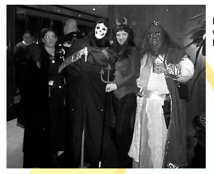
Looks like Death and the Devil were fighting over b'Sel and K'iHQaS

I'd say our little Devil definitely prefers Klingons